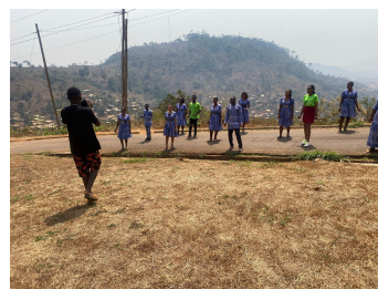
6) Video making